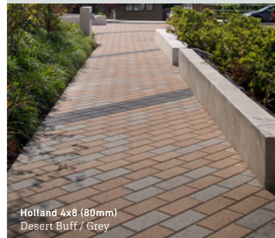
Holland 4x8 (80mm) Desert Buff / Grey