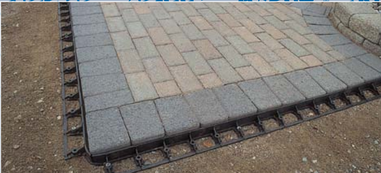
All paver applications require a restrained edge to prevent lateral movement.