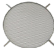
25" Spark Arrestor