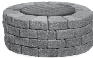
RomanStack Fire Pit