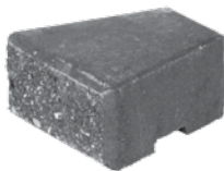
Tight Radius Unit