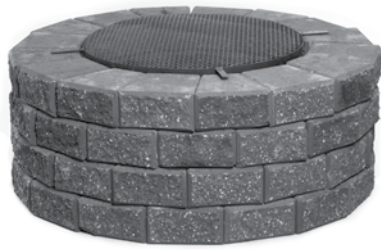
StackStone Fire Pit